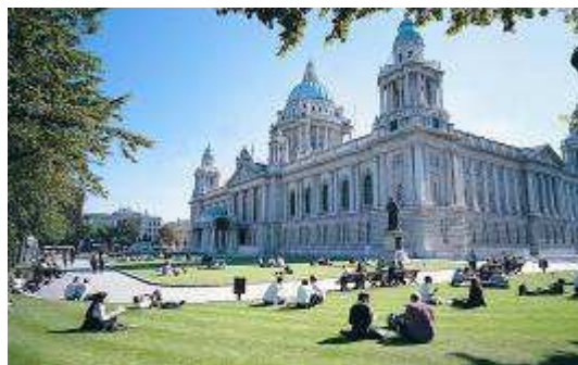
Belfast City Hall