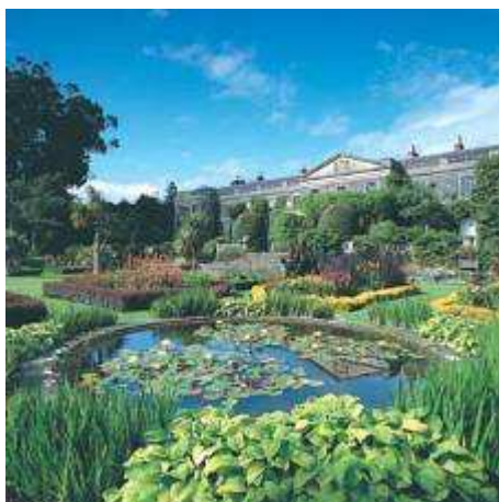
Left: Mountstewart Below: Castlewellan Forest Park